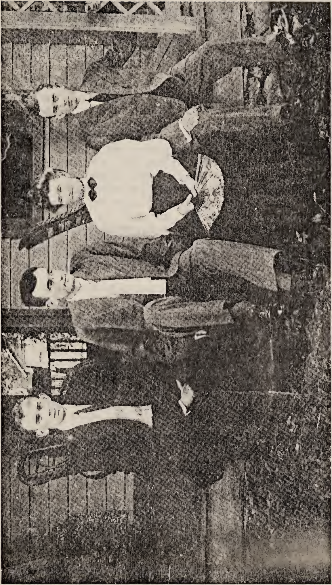
The West Wing Porch